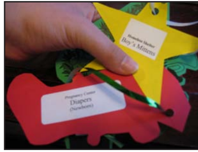
Caring Tree ornaments help three groups.

St. Mary's school to prepare Christmas baskets of food, clothing, and gifts and for needy families.